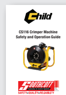
Safety & Operation Manual