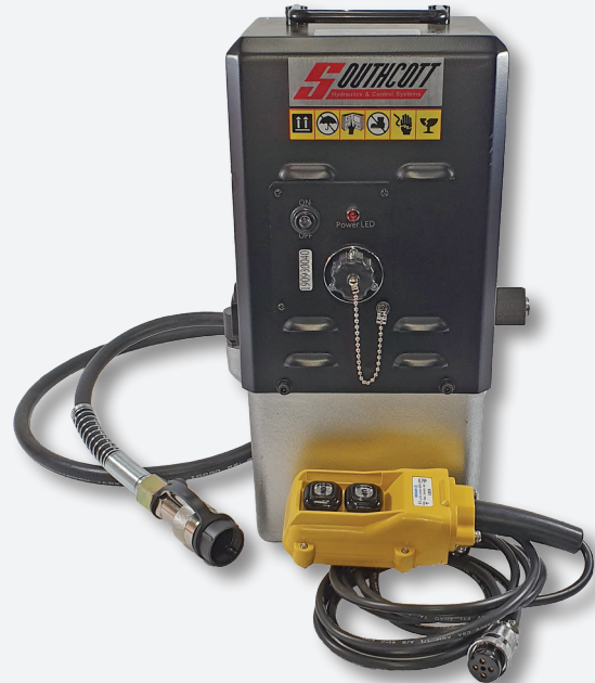
SPM-1000 (220V) 700 Bar Oil Pressure, 2.6Ltr Reservoir Capacity, 17.5kg