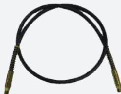
SH-1.8M (Hose Assembly) 1.8mtr Hose Assembly (Image for Reference Only)