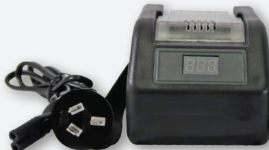
SCH-07 18Volt Li-Ion Battery Charger AC100-240V Input, 0.4kg