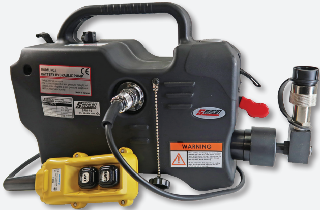
SPM-P5 (18V) 700 Bar Oil Pressure, 1.4Ltr Reservoir Capacity, 6.5kg (without Battery)