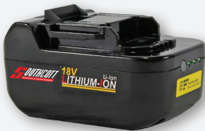
SB-04 18Volt Li-Ion Battery, 120 min. Charge Time, 4Ah Capacity, 0.65kg