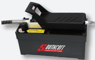
SAP-1000 (Single Speed Type) 700kgF/cm 2 Oil Pressure, 7-10 Bar Air Pressure, 3/8 NPT Port Thread, 1.0Ltr Reservoir Capacity, 6.6kg