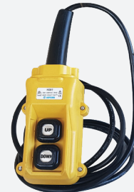
SRC-1 (Up/Down Function) Pendant for Electric and Battery Hydraulic Pump