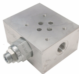
SMC3P1A-R-TT08 Tank Top c/w Relief nom flow = 20L/Min