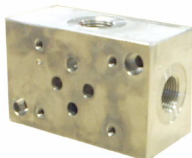
S4224 S4224S S4225